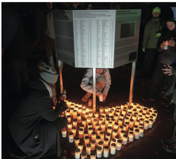
Inauguration of the commemorative plaques 2022

In November 2022, the women who were killed were given a place to be publicly remembered. Confirmands read out their names and lit candles for them during the dedication of the memorial plaques. This finally gave the women a place in the collective memory of the district.